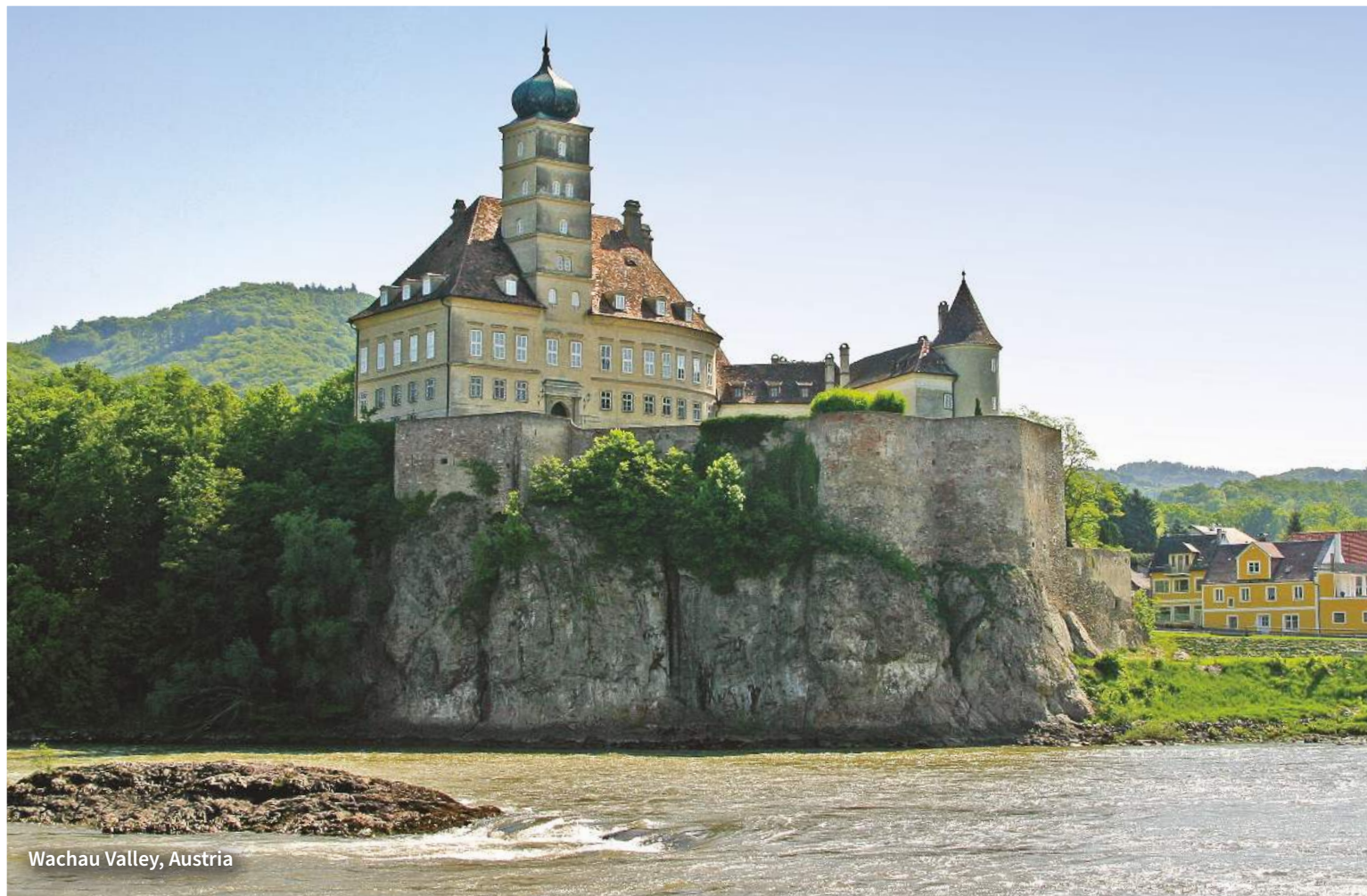
Wachau Valley, Austria